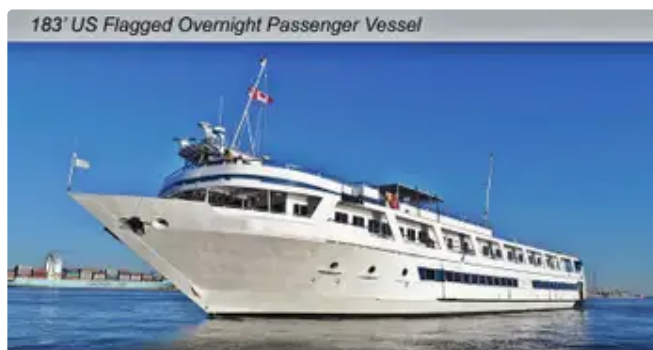
183' US Flagged Overnight Passenger Vessel

CERTIFICATION Built by Babcock Industries Inc. in 2007 Keel laid 14 November 1995 / Delivered 29 June 1997 Hull #294 / Official Number 1056204 Vessel repossessed in 2009 USCG Inspected Subchapter T-K SOLAS '74 - Pending COI May 9, 2020 / Pending scheduled drydock ABS Loadline Certificate